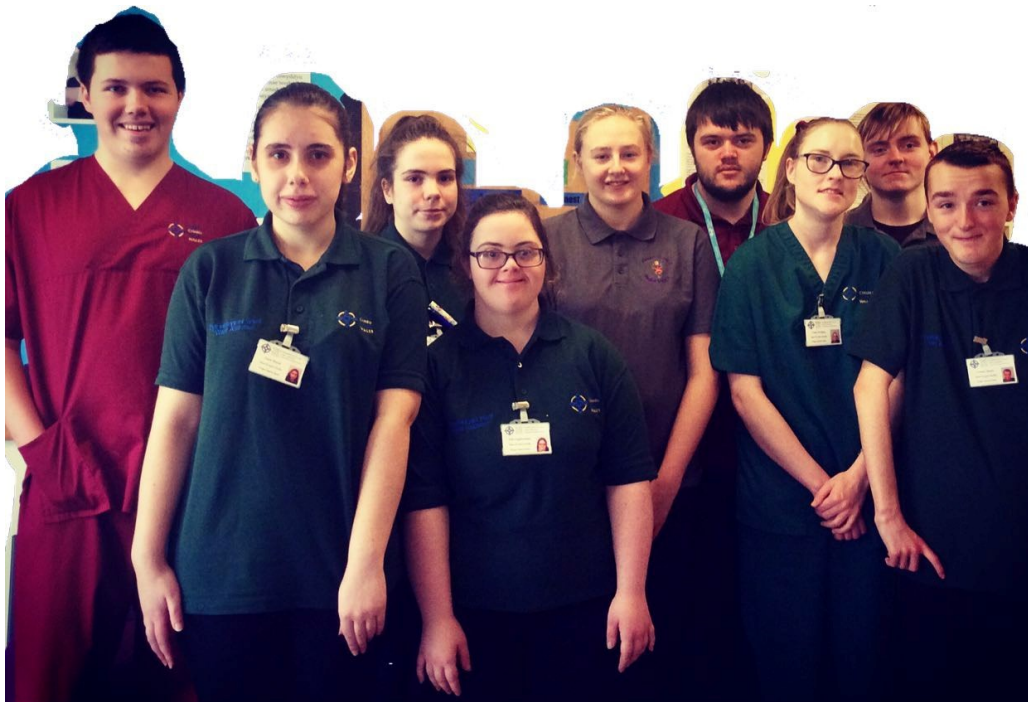
An image of previous Engage to Change Project SEARCH Participants at Betsi Cadwaladr UHB

DFN Project SEARCH is a one-year internship programme supporting young people with a learning disability to gain the skills and experience to move into paid employment.