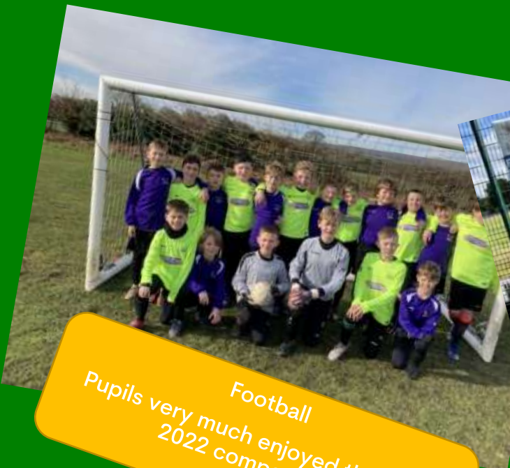
Football Pupils very much enjoyed the Urdd 2022 competition.