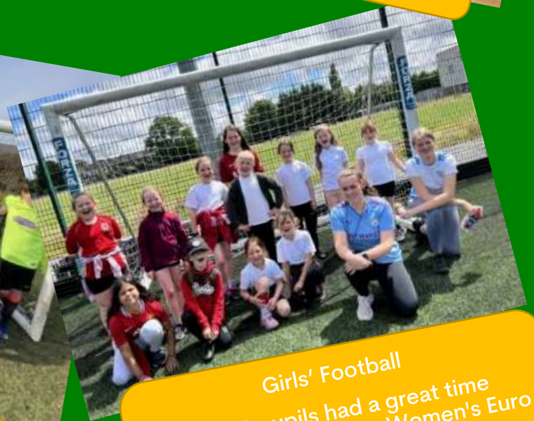
Girls' Football Year 3 pupils had a great time before the start of the Women's Euro cup competition