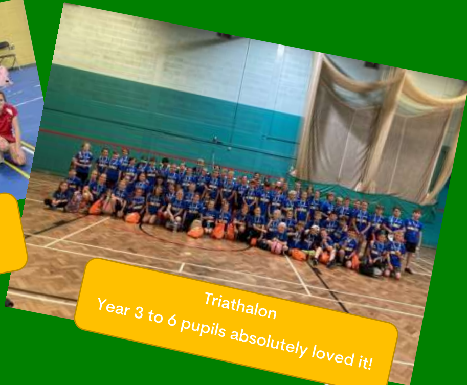
Triathlon Year 3 to 6 pupils absolutely loved it!