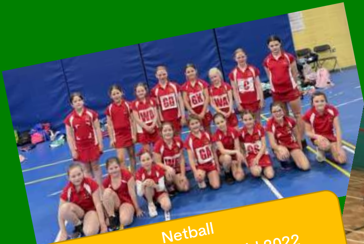
Netball Pupils enjoyed the Urdd 2022 competition

We have also managed to hold sports days and the youngest pupils were delighted to see their parents and grandparents doing an egg race on a spoon.