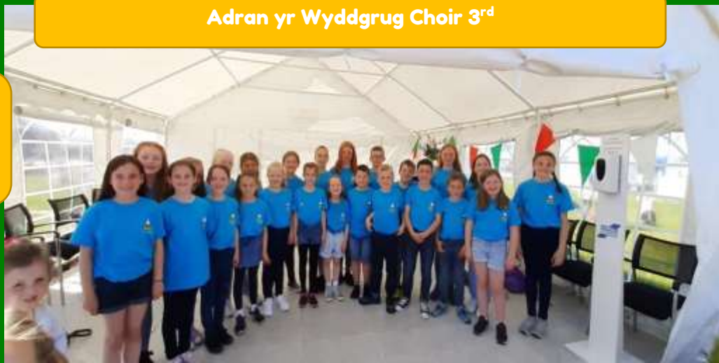
Adran yr Wyddgrug Choir 3 rd