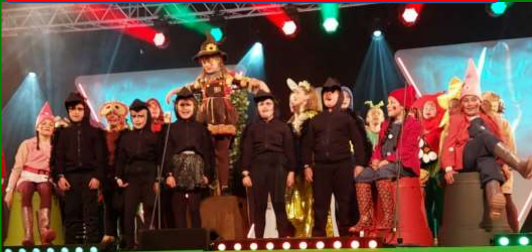
Action song 3 rd