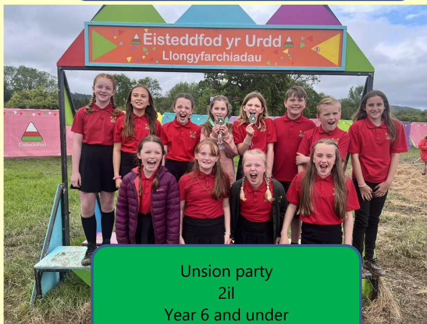
Unsiôn party 2il Year 6 and under

Art and Craft results Celf a Chrefft / Arts and Crafts Results 2024 | YCHWAEGU