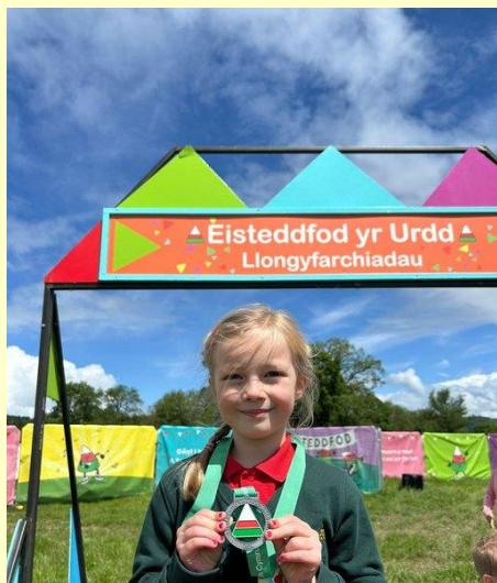
Alaw 2il Cerdd Dant solo Year 2 and under